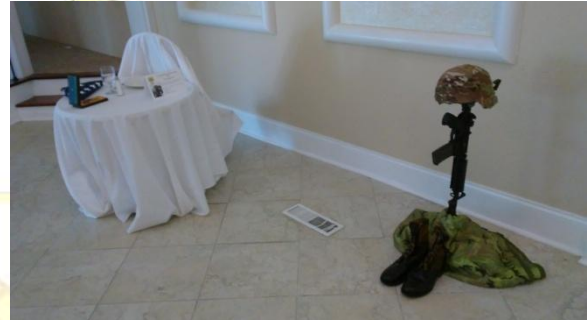
Missing Man Table and Soldier's Cross Memorial Honoring our Lost Psywarriors