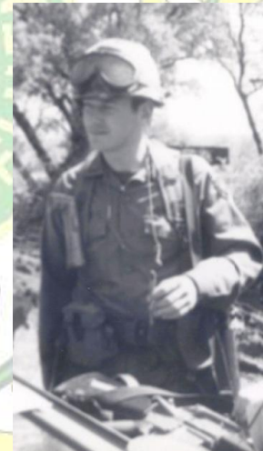
Serving with the 8 th PSYOP Bn.

He instructed the Joint PSYOP Staff Planning Course, active and reserve PSYOP Officers and Advanced Individual Training courses at the US Army John F. Kennedy Special Warfare Center and School. He produced FM 33-1-1 (PSYOP Techniques and Procedures), contributed to FM 33-1 (PSYOP Doctrine) and produced PSYOP training videos and aids. He guest instructed at the United Kingdom PSYOPS course at the UK Intelligence School at Ashford Kent.