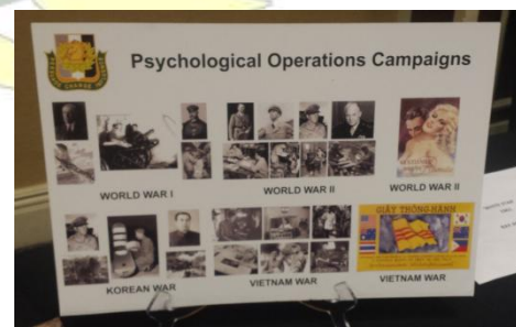
Part of POVA's SOAR Table Display