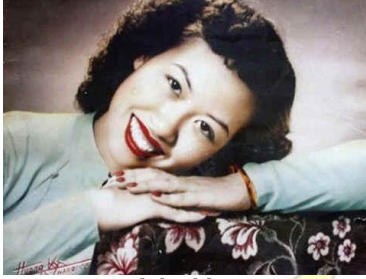
Trinh Thi Ngo Hanoi Hannah

Her name was Trinh Thi Ngo. We called her Hanoi Hannah. She called herself Thu Hong, " the fragrance of autumn ". (Note: The alias -- Thu Huong -- or Autumn Fragrance, was easier for her non-Vietnamese listeners to pronounce. Her job was to chill and frighten, not to charm and seduce. Her voice was as smooth as silk, her English impeccable, and as North Vietnam's premier propagandist, "Hanoi Hannah" tried to convince American G.I.'s that the war was immoral, that they should lay down their arms and go home.