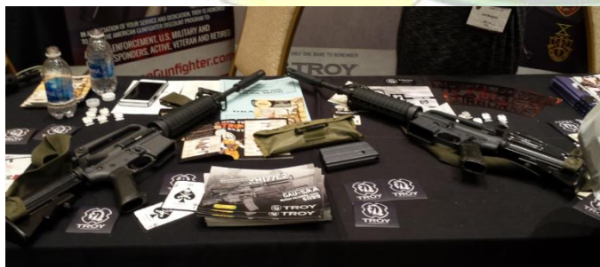
Special Opns mementoes, 2 rifles raffled to raise funds