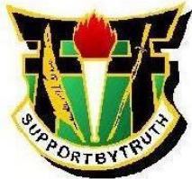
7 th PSYOP Group Unit Crest

The 7 th PSYOP Group is one of two groups that are part of the US Army Civil Affairs and Psychological Operations Command (USACAPOC). Commanded by COL Randall S. Cartmill, the 7 th Group is located at Moffett Field in the San Francisco Bay area.