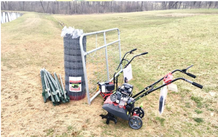
Milk & Honey Farms New POVA-supported equipment Helping to relieve hunger!

We were also able to purchase 300' of field fence, 30 metal t-posts, and a 12' gate. These materials were needed for the new field that we have leased for 2018. We will now be able to keep out the deer/goats/and any other critter dedicated to eating our harvest in the new field.