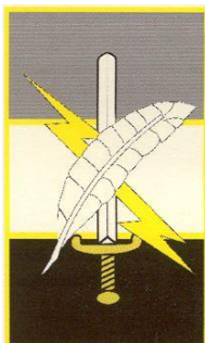
POA Org Crest

Our partner organization, the Psychological Operations Association (POA), is encouraging its current members to renew their dues for 2018. As POA and POVA have partnered over the past several years (decades?), all POVA members are encouraged to become POA members. POA offers some great benefits to members. Our relationship has been excellent.