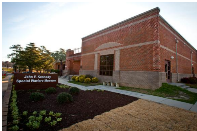
USA JFK Special Warfare Museum

Exhibits begin with World War I and include displays on the First Special Service Force, the Office of Strategic Service, and Detachment 101 in World War II, the Korean conflict, as well as modern actions in Operations Desert Storm, Enduring Freedom and Iraqi Freedom. It also serves to illustrate the unique and specialized part played by all aspects of the Army special operations community both in conflict and during crucial roles in peacetime.