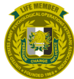
New POVA Life Member Pin