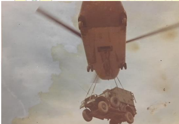
6 th PSYOP Battalion being heli-lifted in May 1968, Viet-Nam

The AN/MSQ-85 was the primary system in the U.S. inventory designated for tactical point dissemination of video products in other-than-broadcast mode. Few of the AN/MSQ-85B still exist in their original configuration, and these are more museum pieces of 1970s technology than usable equipment. The AN/MSQ-85B includes an AQ-4A movie projector, AN/UIH-6 public address system, AP-9 slide projector, AN/USH two-track international standard tape recorder, BM-22A large projection screen and R-520A/UUR radio receiver.