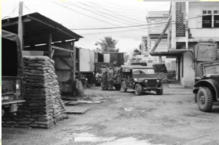
POL, storage, and officer quarters