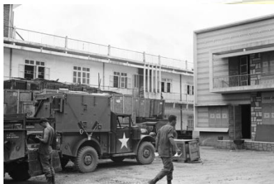
Bn HQ Offices and Enlisted Quarters