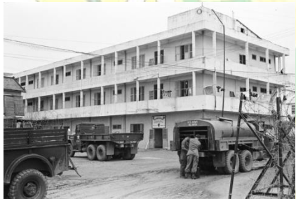
Bn HQ and Enlisted Quarters

During monsoon, it was often a sea of mud: