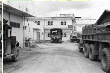
General View of the Battalion compound