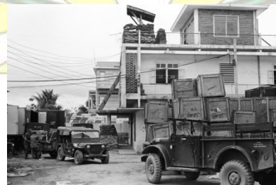
Guard post, Bn vehicles