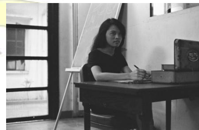
Battalion admin support

The entire set of Ken's pictures will be uploaded to our new website, with captions where possible. It is part of our POVA history that Ken has helped us all to preserve.