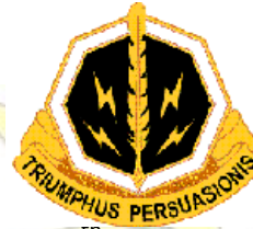
8 th PSYOP Battalion