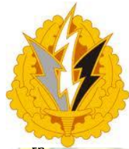
6 th PSYOP Battalion