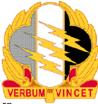
4 th MISGroup (A) 4 th PSYOP Group

These new PSYOP battalions were strengthened in their authorized manning and equipment, and immediately launched into major operations in support of US and Viet-Nameese ground operations in their AOR's.