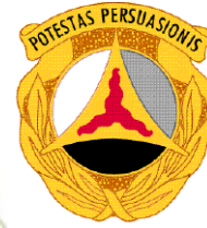
10 th PSYOP Battalion

In spring 2015, the 6 th Battalion celebrated the 50 th anniversary of its original creation and deployment to Viet-Nam. POVA was very pleased and proud to contribute to and participate in this celebration, even preparing and presenting a Powerpoint presentation on the 6 th Battalion's history in Viet-Nam. This was especially satisfying when several of today's 6 th Battalion soldiers commented that they had very little awareness of the Battalion's combat history which began in Viet-Nam.